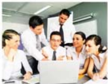
ABB Consulting provides technical and engineering services to improve performance in the areas of compliance, operations and engineering to customers in the chemical, petrochemical, oil & gas, power, pharmaceuticals, metals and consumer industries worldwide. We offer expertise in the following areas: environmental services, industrial energy efficiency, inspection, integrity management, operations improvement, process safety, project services, specialist functional engineering, technical software and technical training. www.abb.com/consulting

Technical Consultancy. Engineering the future today.